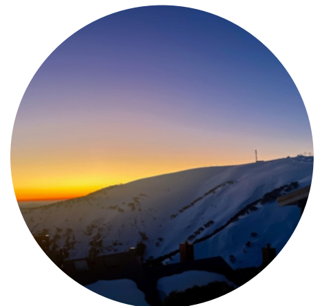
The best sunset views from Lawlers over The Drift