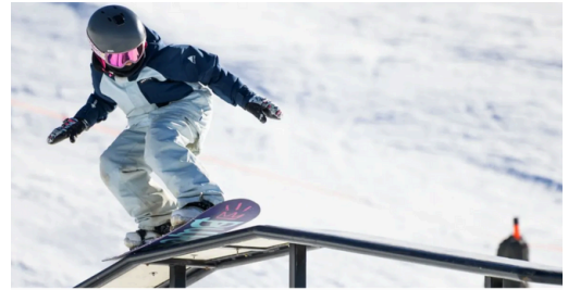
EXCITING UPDATES FOR THE 2025 SEASON

Hotham reveals plans for new progression focused freestyle and terrain park zone